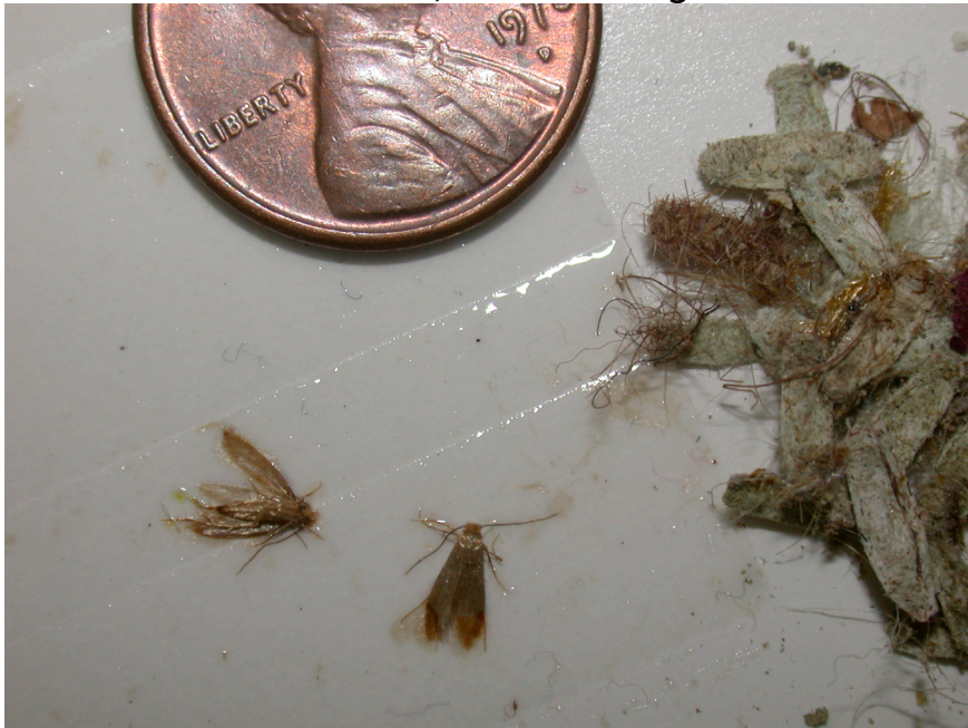
Casemaking Cloths moth and larval cases

Casemaking ( Tinea pellionella ) and webbing clothes moth ( Tineola bisselliella ) numbers have increased in recent years. Part of the problem may be due to the increase in imported woolens and carpets. Adults are small 1/3 inch yellowish tan to buff colored moths that are weak fliers, prefer darkness and rarely come to lights. If large numbers of small moths are seen flying indoors it is more likely you have a problem with food infesting grain moths. The damaging stage for cloths moths are small white worm-like caterpillars with dark heads. Larvae feed on wool clothing, wall hangings, feathers, silk garments, felt, furs, hair (including taxidermy mounts), wool rugs and carpeting. They prefer fabric that has been stained with oils, blood, urine, food, or beverages. Feeding damage appears as small irregular holes. Damage will be most likely on undersides of wall hangings, beneath furniture, along baseboards, in non-vacuumed closets, and clothing stored on the floor.