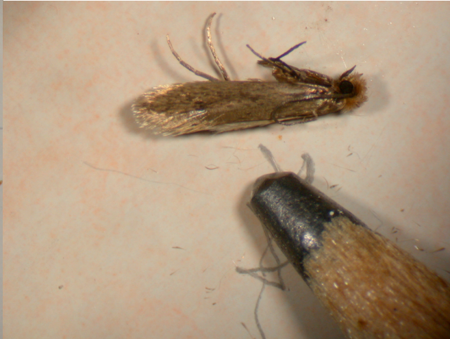
Case madding cloths moth