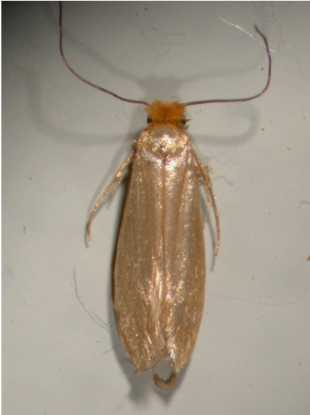
Webbing cloths moth adult